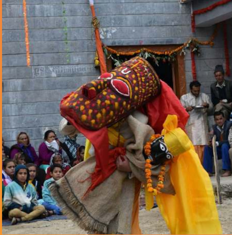
Natives performing at Salud-Dungra, Uttarakhand

multicoloured art and culture of Uttarakhand to the whole world. Various episodes, like mythological and historical stories of the Ramayana, are performed through dance drama in "Ramman". UNESCO has declared "Ramman" world heritage site, which is a matter of pride for all of the native citizens. The historical and fictional characters who entertain the audience during Ramman are Banyan-Banyan, Malla & Kuru-Jogi, etc. In the Ramman festival, dance is also performed by wearing the masks of many deities, and they are invoked through Jagar songs. The "Ramman" festival organised in Salud-Dungra village is related to Bhumiyaal, the folk deity of Uttarakhand. Bhumiyaal Devta is the God of justice. In Uttarakhand, there has been a tradition of collectively worshipping the Bhumiyaal deity during the harvesting period since ancient times. In Salud-Dungra village too, the Bhumiyaal deity is worshipped in the families for three days before the Ramman festival. On the night before Baisakhi, the people of the village gather at one place, and Jagran is organised. In the local language, this event is called